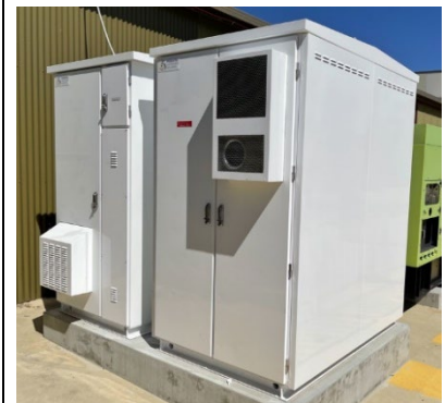
ChargeCach-M for illustration only – ChargeCache-L (this datasheet) is wider

PowerCache is a utility-grade grid in a box. It enables operators of ultra-fast EV charging, commercial or industrial sites, microgrids and communities to provide an unconstrained power user experience on a constrained network. This versatile power system combines a robust, ultra-rapid-response power converter/controller and a high-performance battery with intelligent microgrid control. PowerCache is expandable and integrates with other systems on-site. It can participate in ancillary services markets.